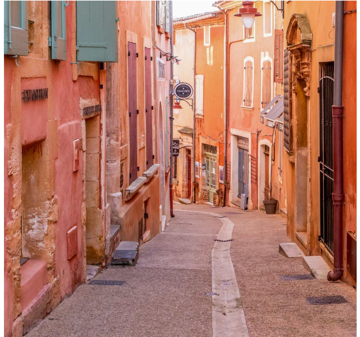
Beautiful Village of Roussillon