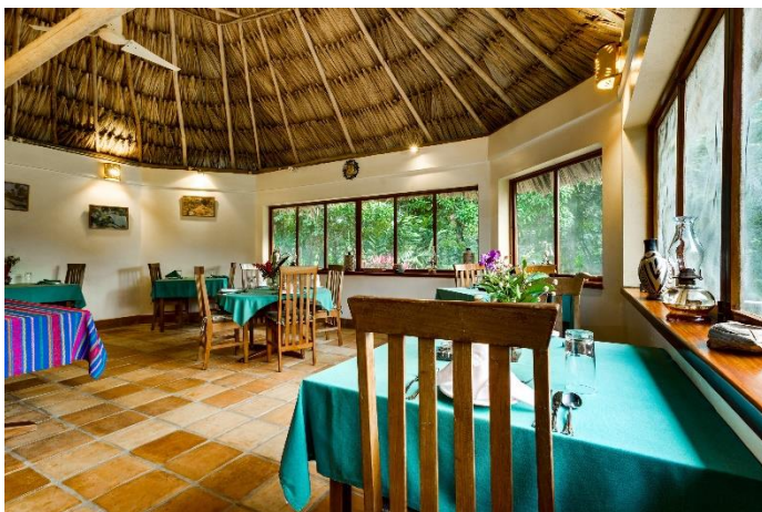
Tanager Rainforest Lodge