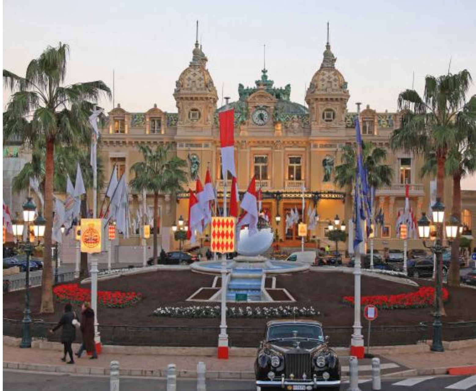
Monaco's Monte-Carlo Casino