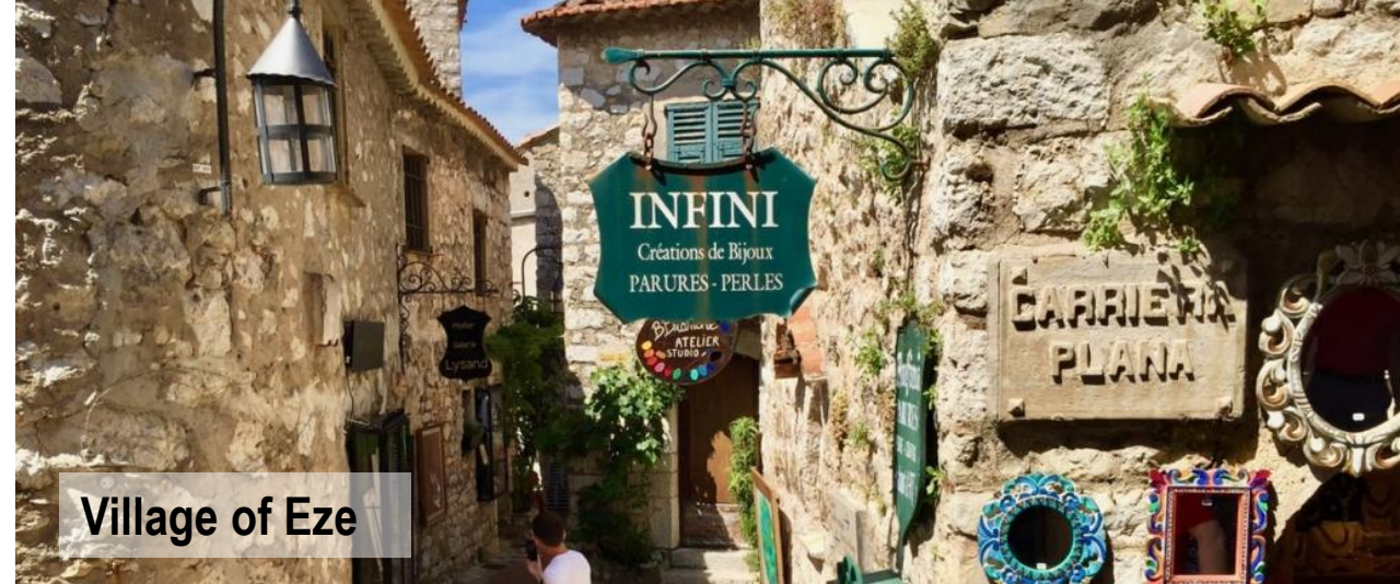
Village of Eze