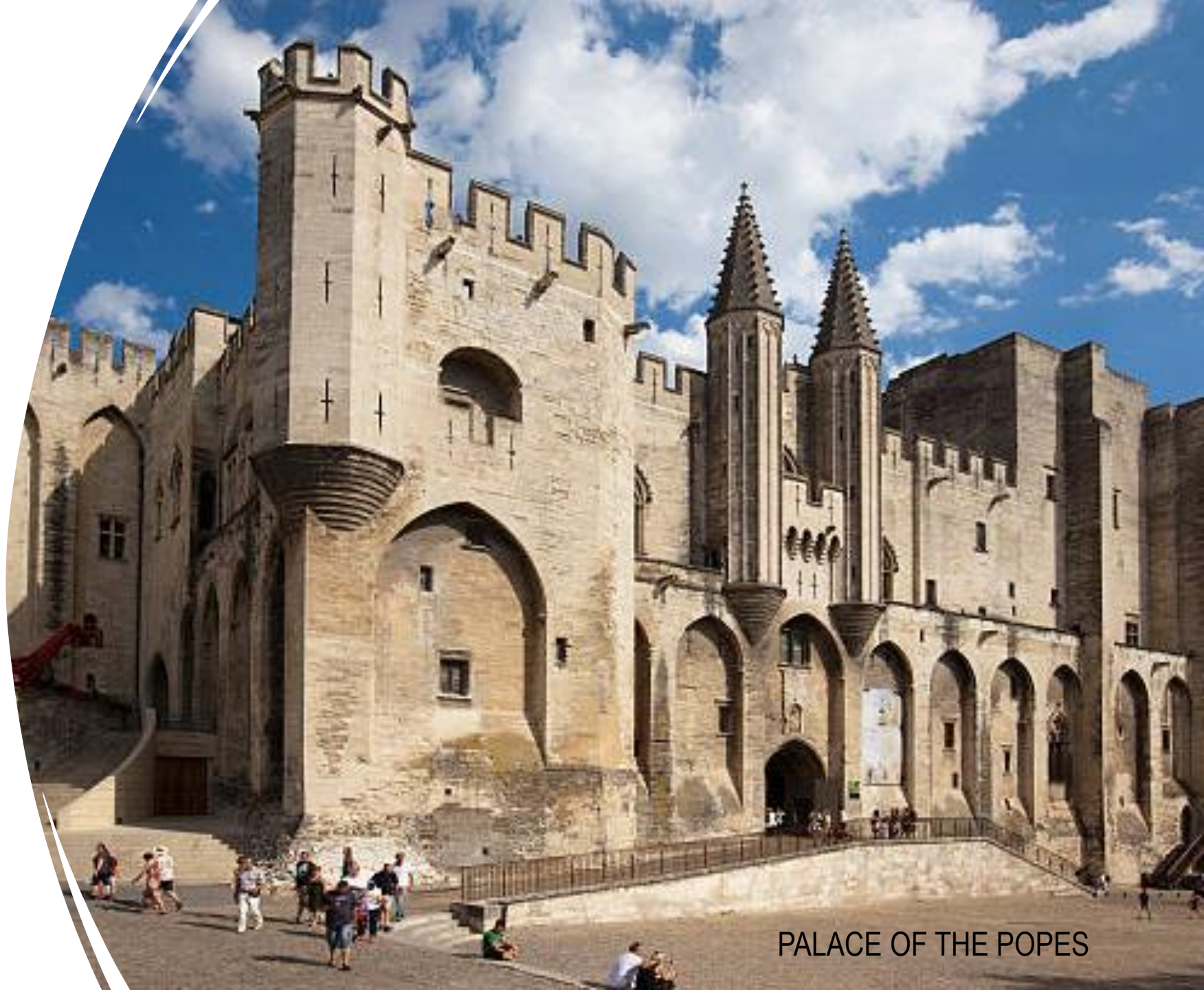
PALACE OF THE POPES

EVENING: Enjoy a 3-course welcome dinner in a local restaurant walking distance from your hotel. (drinks not included)