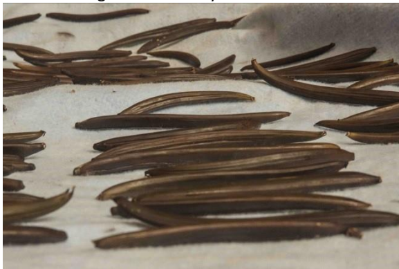
Vanilla pods on the drying rack.