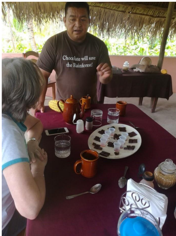
Learning about cacao and chocolate