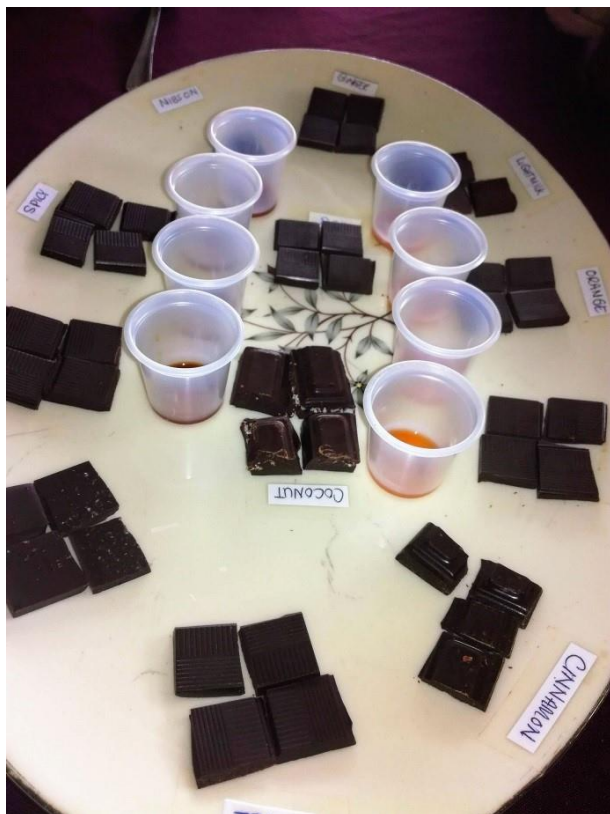
Chocolate and cocoa samples