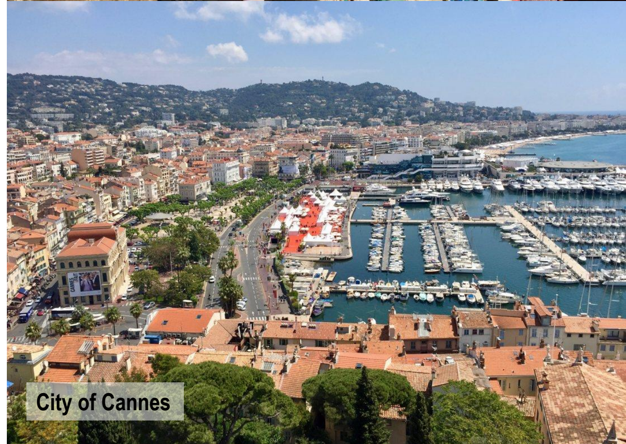
City of Cannes