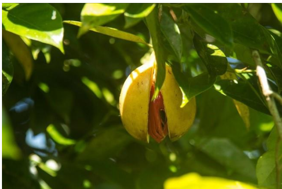
Nutmeg surrounded by red mace.