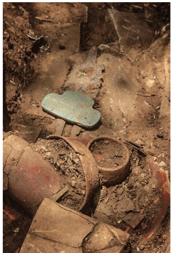
Jade, flint, and pottery found in tomb at Nim Li Punit