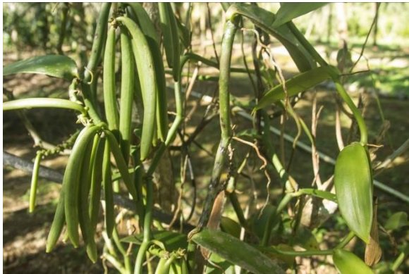
Vanilla orchid pods on the vine