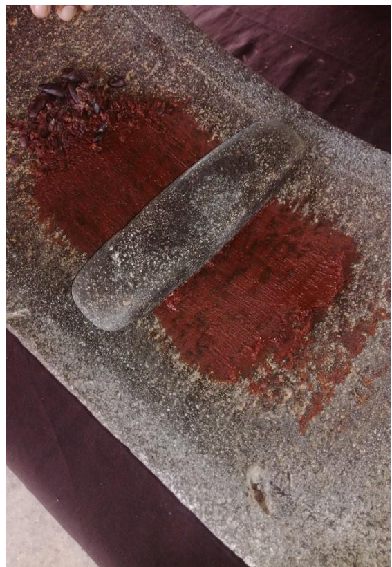
Cacao beans ground to a paste